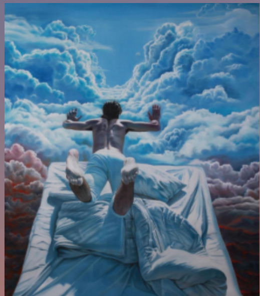
Trust is an oil on canvas painting by Netanel Morhan.