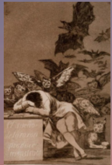
The Sleep/Dream of Reason Produces Monsters (Spanish: El sueño de la razón produce monstruos) is an aquatint by the Spanish painter and printmaker Francisco Goya. Created between 1797 and 1799 and currently housed in the Nelson Atkins Museum of Art, Kansas City, Missouri, US.