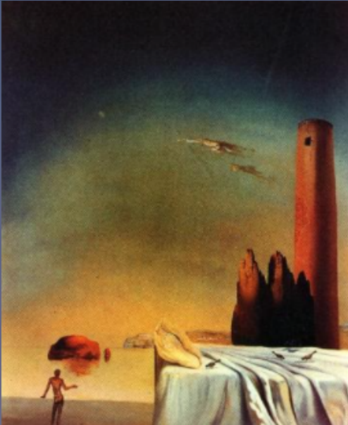
Le rêve approche (The Dream Approaches) painted by Salvador Dalí from 1932-33, now hangs in the Perls Gallery, New York.