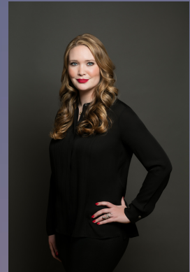
Sarah J Maas