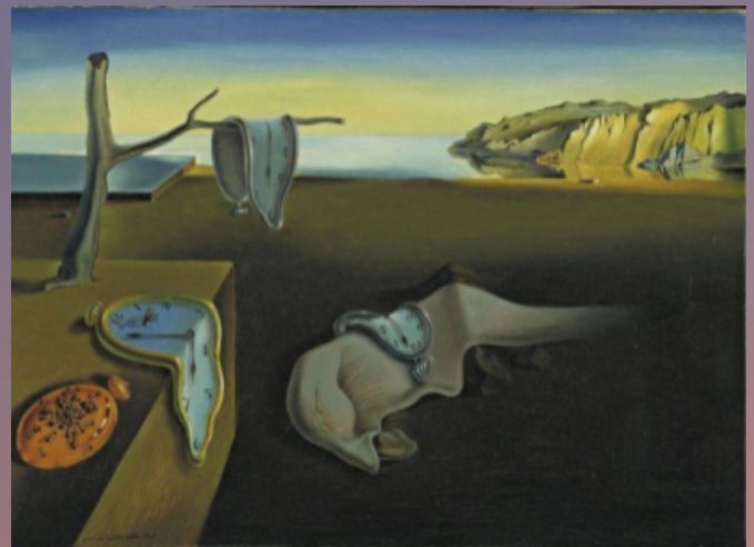
The Persistence of Memory (In Catalan: La persistència de la memòria) is a 1931 painting by artist Salvador Dalí and one of the most recognizable works of Surrealism. The painting has been in the collection of The Museum of Modern Art (MoMA) in New York City.