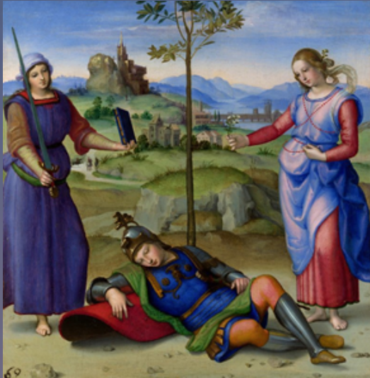
The Vision of a Knight (also called The Dream of Scipio or Allegory) painted by the Italian Renaissance artist Raphael, finished in 1503-1504. It is currently in the National Gallery in London.