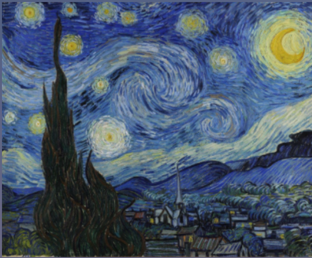
The Starry Night is an oil on canvas painting by Dutch Post-Impressionist painter Vincent van Gogh. It was painted in June 1889.