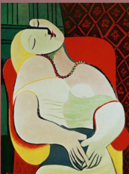
Le Rêve (meaning The Dream) is a 1932 oil on canvas painting by Pablo Picasso, then 50 years old, portraying his mistress Marie-Thérèse Walter, who was in her early twenties. It is said to have been painted in one afternoon, on 24 January 1932

"Everything that's lovely is but a brief, dreamy kind of delight." ~ William Butter Yeats