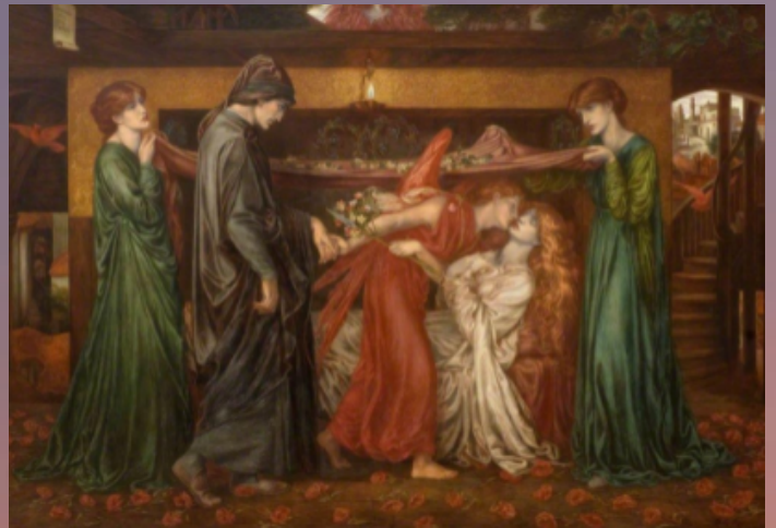
Dante's Dream (full title Dante's Dream at the Time of the Death of Beatrice) is a painting from 1871 by the English Pre-Raphaelite painter Dante Gabriel Rossetti.