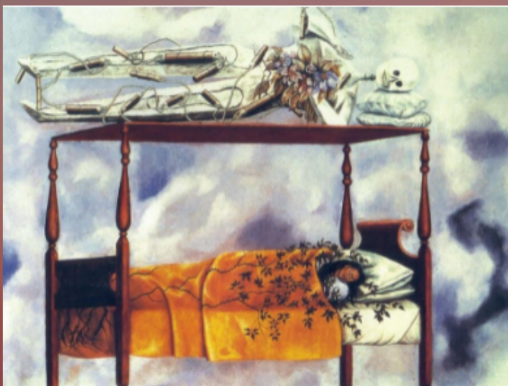
Dream of The Bed, painted in the year of 1940 by Frida Kahlo, she expresses her feeling and interception of death.

"Looking at the stars always makes me dream. Why, I ask myself, shouldn't the shining dots of the sky be accessible as the black dots on the map of France?"