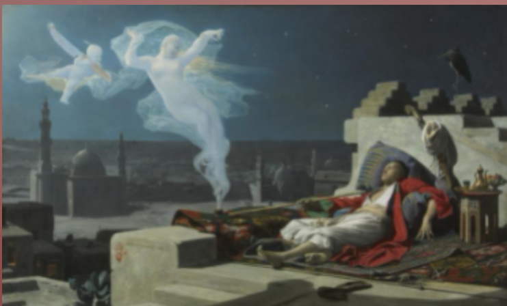
A Eunuch's Dream an 1874 painting by Jean Lecomte du Nouÿ, inspired by Charles Montesquieu's Persian Letters (published in 1721) is housed in The Cleveland Museum of Art, Ohio.

"The moon which the sky never saw even in dreams has risen again."