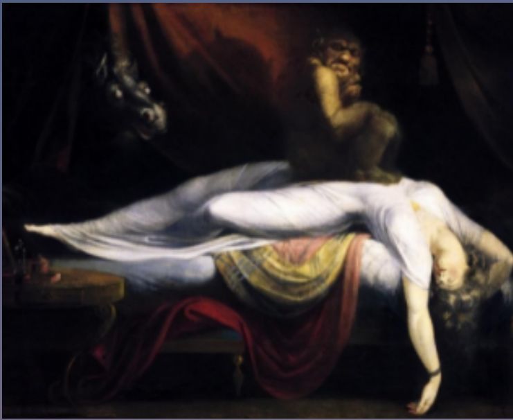
The Nightmare is a 1781 oil painting by Anglo-Swiss artist Henry Fuseli; currently located at Detroit Institute of Arts, Michigan.