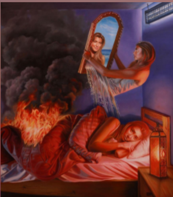
Night Attack is another painting by Natenel Morhan.

"Sometimes, the best dreams are best left dreams." ~ Atticus